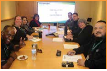
BOARD TRAINING – CLCA leaders attend breakouts where they receive training for their specific board function. This is a great forum for them to meet leaders in the same role from different parts the state.