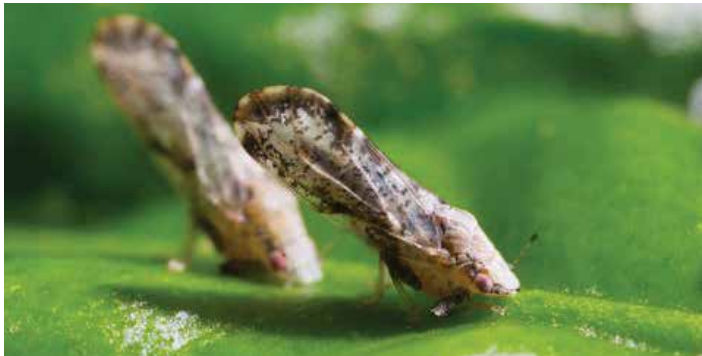
The Asian citrus psyllid, pictured here, spreads the bacterium that causes Citrus Greening Disease.

Because the peptide only needs to be reapplied a few times per year, it is highly cost effective for growers. This peptide can also be developed into a vaccine-like solution to protect young healthy plants from infection, as it is able to induce the plant's innate immunity to the bacteria.