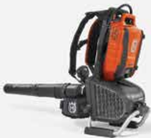
550IBTX BACKPACK BLOWER