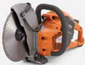
K535I POWER CUTTER