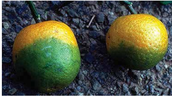
Oranges afflicted with Citrus Greening Disease.

“This peptide is found in the fruit of greening-tolerant Australian finger limes, which has been consumed for hundreds of years,” Jin said. “It is much safer to use this natural plant product on agricultural crops than other synthetic chemicals.”