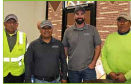
MISSION LANDSCAPE reps attend to get a refresher on all things drip irrigation, from soil type and how it impacts the drip design, to designing for slopes and change of elevation.